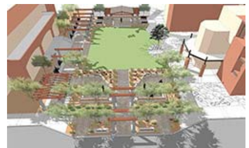
(Above—Rendering of the finished Geraldo Rivera Greek Heritage Park )